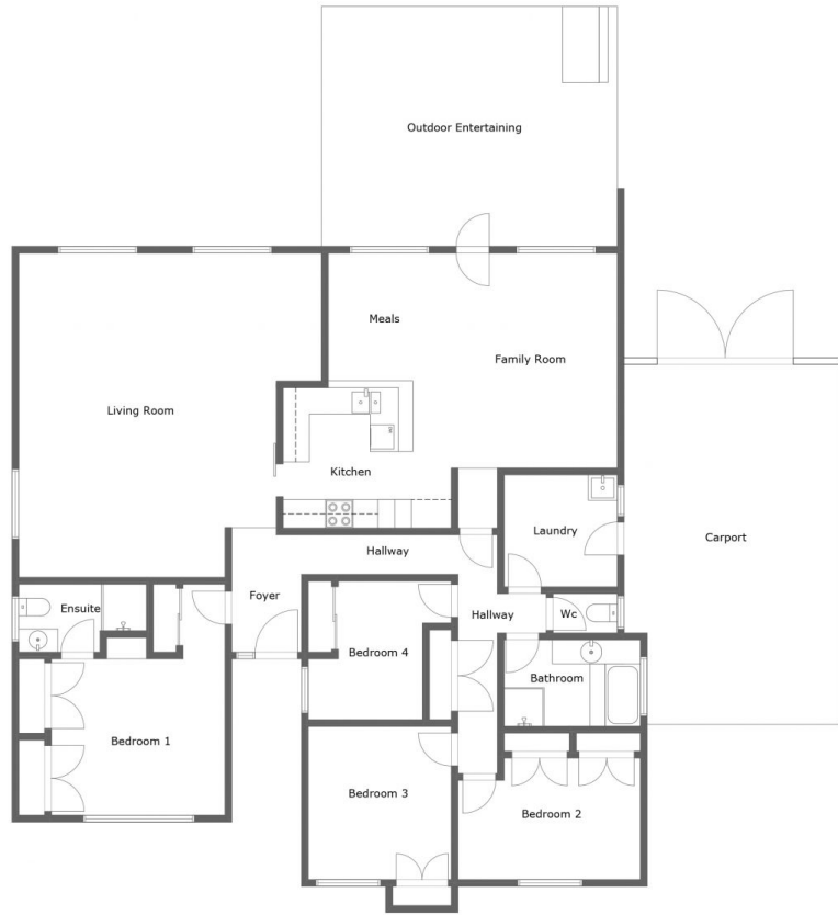
[ ]Ground floor