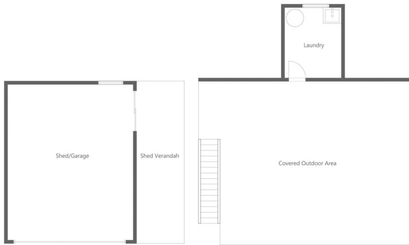
[ ]Ground floor