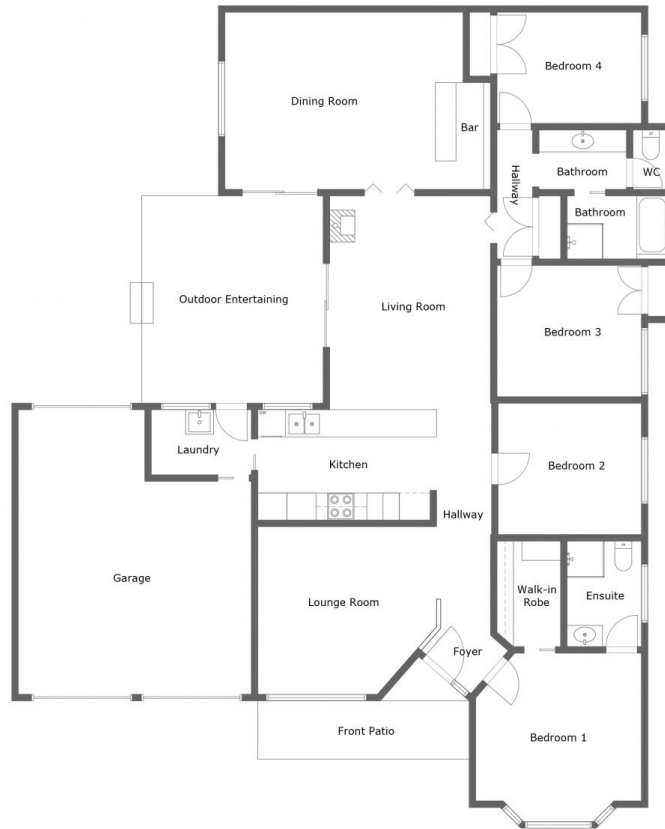
[ ]Ground floor