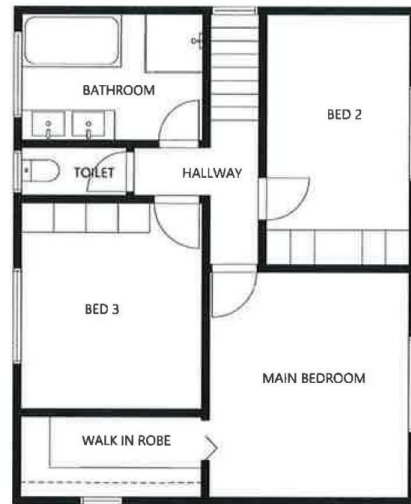
[ ]First floor